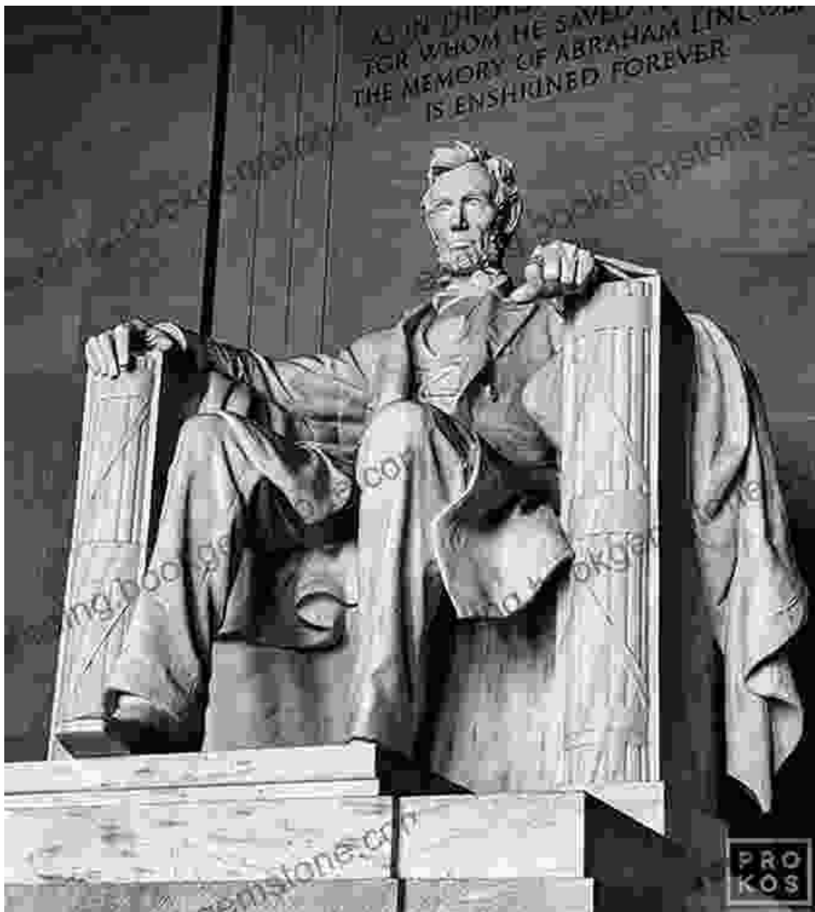
The Lincoln Memorial, featuring Daniel Chester French's statue of Abraham Lincoln

colossal seated figure of Abraham Lincoln, the centerpiece of the Lincoln Memorial in Washington, D.C. This monumental sculpture captures Lincoln's wisdom, strength, and determination, becoming an enduring symbol of American history.