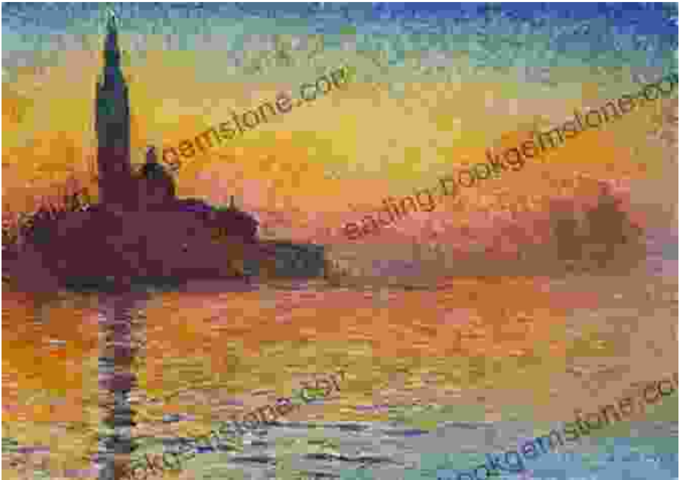
Claude Monet, 'San Giorgio Maggiore at Dusk,' 1908, oil on canvas, 73 x 92 cm, Musée d'Orsay, Paris

'San Giorgio Maggiore at Dusk' showcases Monet's mastery in capturing the changing effects of light. The painting depicts the island of San Giorgio