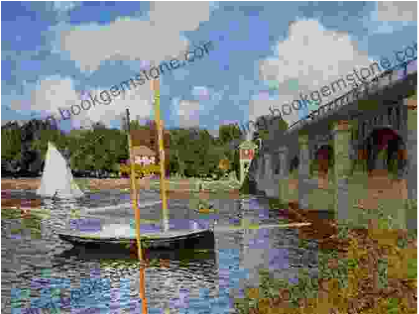
Claude Monet, 'The Bridge at Argenteuil,' 1874, oil on canvas, 60 x 81 cm, Musée Marmottan Monet, Paris

'The Bridge at Argenteuil' showcases Monet's fascination with bridges as architectural subjects. The painting depicts a railway bridge spanning the Seine River in Argenteuil. Monet captures the play of light and shadow on the bridge's structure, creating a sense of depth and solidity. The painting