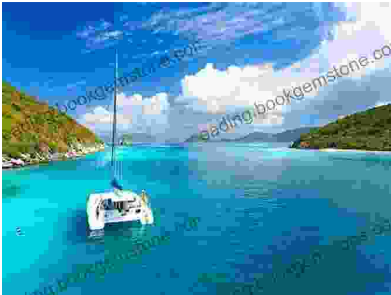
Sailing in the Virgin Islands

Hike through lush rainforests, unraveling hidden waterfalls and panoramic views. Kayak through tranquil bays, surrounded by vibrant marine life. The possibilities for adventure are endless, creating an unforgettable Caribbean experience.