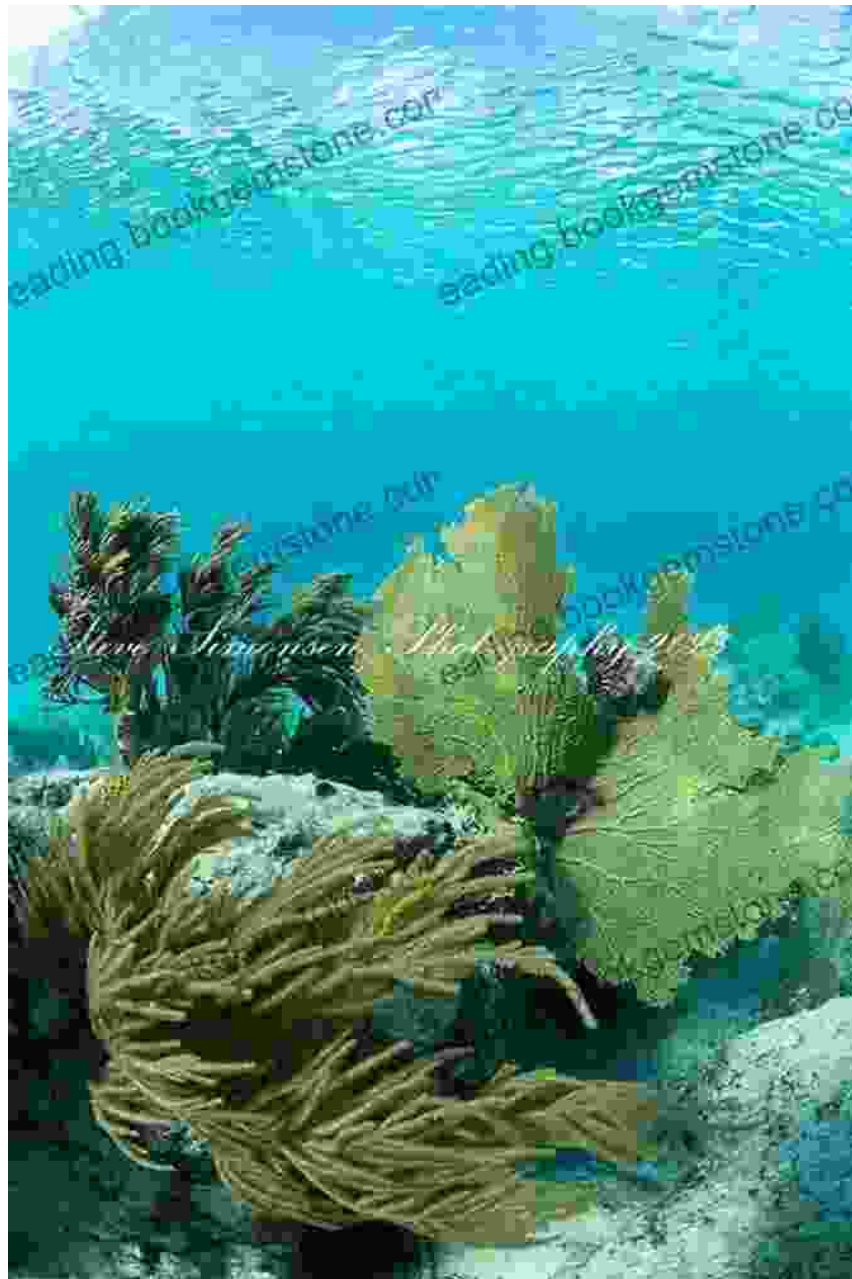
Trunk Bay, St. John